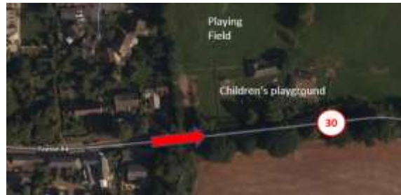
Speed Summary - Teeton Road March 2020

The speed recorded in the report is the last value recorded as the vehicle passes closest to the speed awareness device. The device is sited a significant distance inside the speed limit signs.