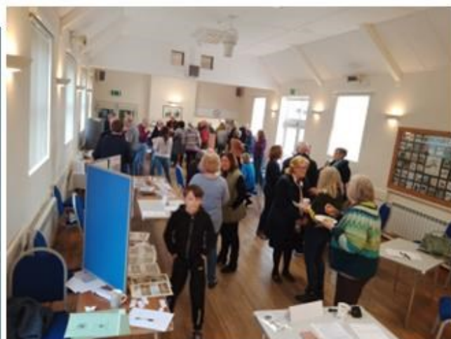
The Village Meeting on 27th April and organised by the Parish Council, was well-attended.