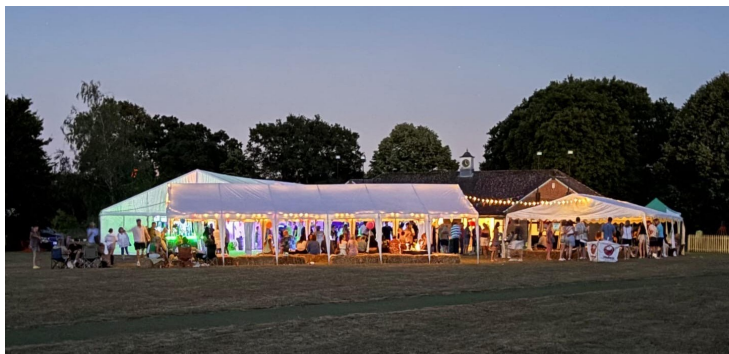
The Beer Festival & Family Fun Day in July was very well supported and a great success. Thank you all.