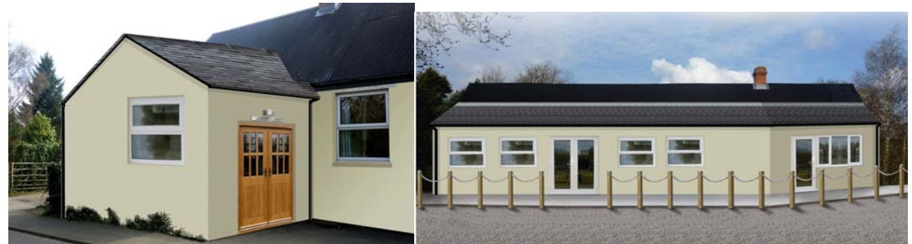
Proposed New Porch and Extension for Ravensthorpe Village Hall

AT THE OPEN MEETING on 13^{th} April to discuss THE WAY FORWARD for the VILLAGE HALL the plans were shown and the costs revealed as £34,00 for the porch and stage removal. The total cost including the rear extension will be £90 to £100,000. So far something over £30,000 has been raised but at least £50,000 is needed before we can expect support from grants etc. which are largely based on matched funding.