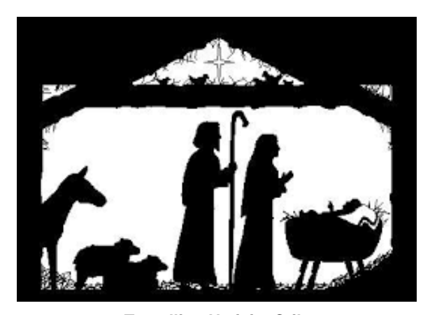
Travelling Nativity Crib

Take time to celebrate the joy of Christmas Day and be back in time for lunch